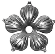
JC2187 R 3-5/8" x 11 Ga.