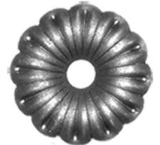
JC2182 R 4" 11 Ga.