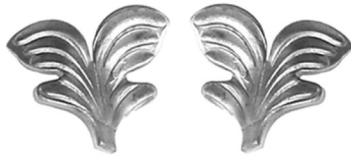
JC2113 2-1/2" x 2-3/4"