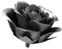
JC2164 R 3" x 2"