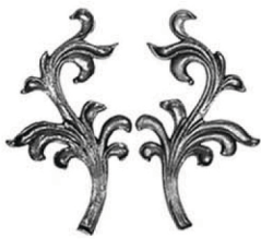
JC4140L/R 9" x 5-1/8"