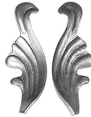
JC2115 4-1/2" x 1-5/8"