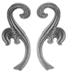
JC4188 2-3/4" x 6-3/8"