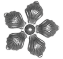
JC3187 R 3-1/4"