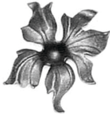
JC4129 4-1/2" x 5-3/8"