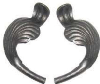
JC3198 5" x 2-3/4"