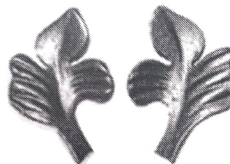
JC4271 3" x 2-3/8"