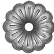
JC2181S R 4"