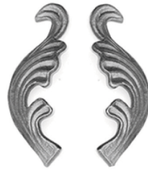
JC4179 2-1/4" x 6-1/4"