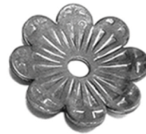
JC2177 R 2-5/8" x 10 Ga.