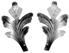
JC2112 2-1/2" x 4-1/8"