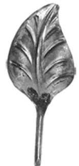
JC3117 8-1/4" x 3-1/8"