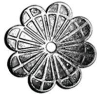
JC2180 R 3-1/2" x 10 Ga.