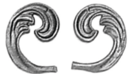
JC4180 3" x 2-3/8"