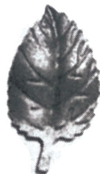
JC2192 2-1/2" x 1-1/4"