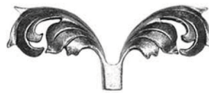
JC4166 4" x 8"