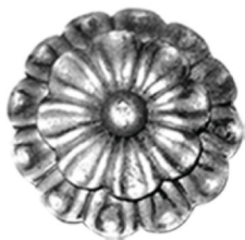
JC2186 R 3-9/16"