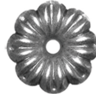
JC2181 R 2-3/4" 11 Ga.