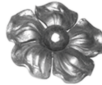
JC3126 R 3-1/2"