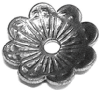
JC2179 R 2" x 10 Ga.