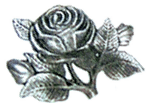
JC4312 5-1/2" x 4-1/2"