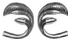
JC4121 3-3/8" x 2-3/4"