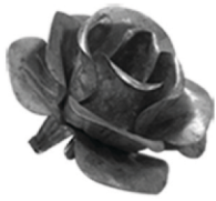
JC2163A R 3" x 2"