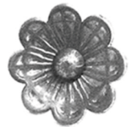
JC2178 R 2" x 10 Ga.