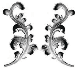
JC4144L/R 11-1/2" x 4-3/4"