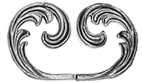
JC4182 4-3/8" x 3-1/2"