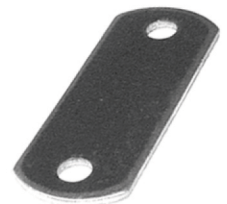
JCRC5 1-1/2" x 3-7/8" 8 Ga, Hole: 3/8"