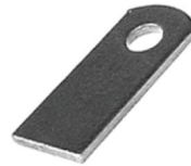
JCRC2 1" x 2-1/2" 10 Ga, Hole: 3/8"