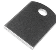
JCRC6 1-1/2" x 3" 9 Ga, Hole: 3/8"