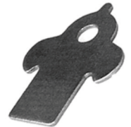
JCRC1S 1" x 2-1/2" 12 Ga, Hole: 3/8"