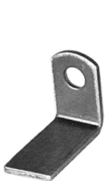
JCRC7S 1" x 1-1/2" x 2" 9 Ga, Hole: 3/8"