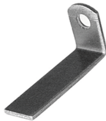
JCRC7L 1" x 1-1/2" x 3" 9 Ga, Hole: 3/8"