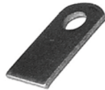
JCRC2S 1" x 2" 10 Ga, Hole: 3/8"