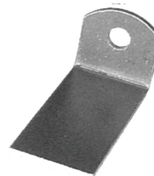
JCRC8L 1-1/2" x 3" 8 Ga, Hole: 3/8"